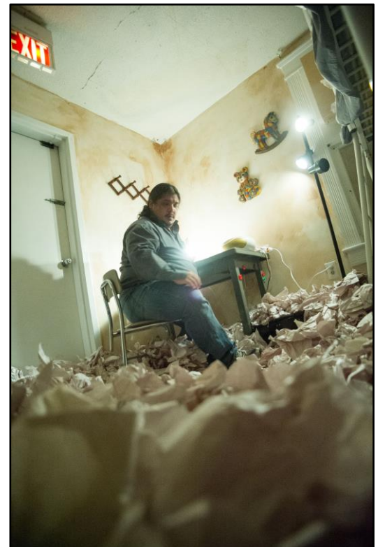
Hello my Name Is... (2017) The Welders