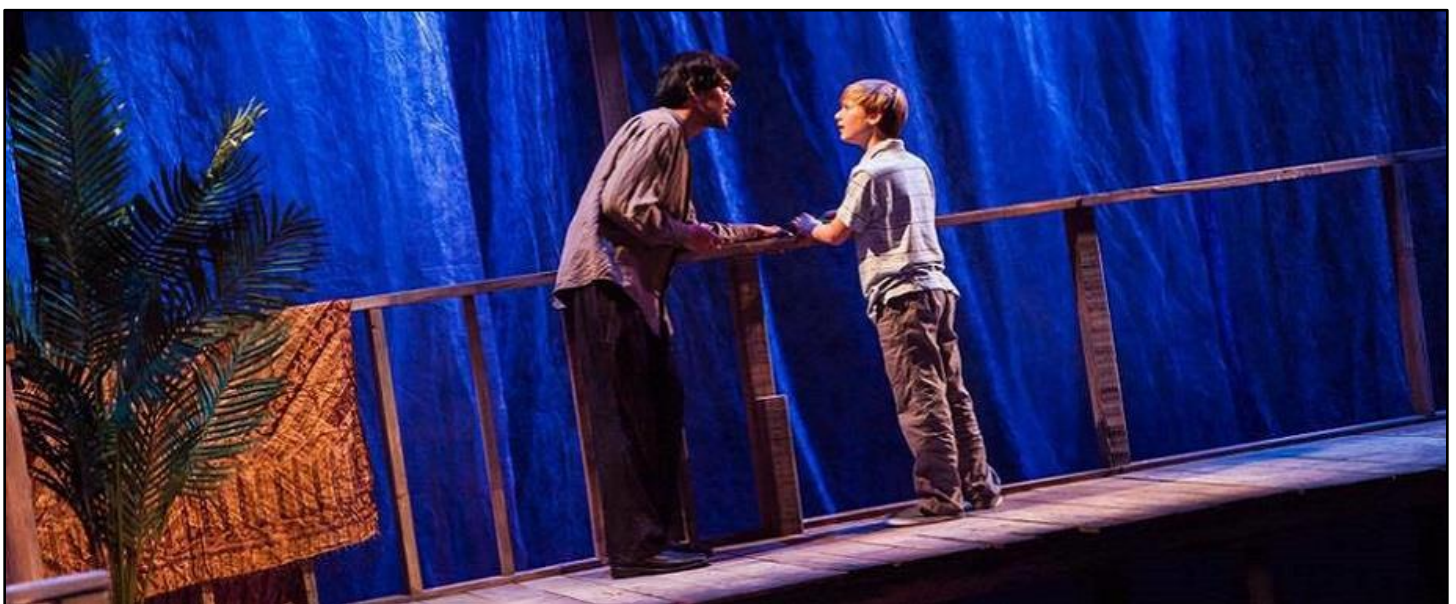
Forgotten Kingdoms (2017) Rorschach Theatre

- Washington Post (About Forgotten Kingdoms - Playwriting)