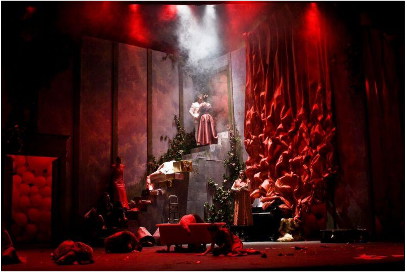
Big Love by Charles Mee: Catholic University 2015