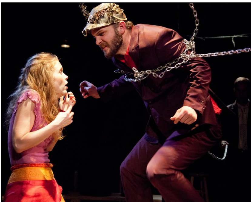
The Minotaur (2013) Rorschach Theatre