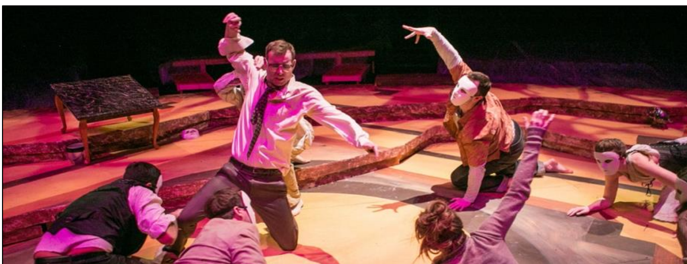
very still and hard to see (2015) Rorschach Theatre

FOR A COMPLETE LIST AND FOR SHOWS BEFORE 2006, PLEASE VISIT randybakerdc.com